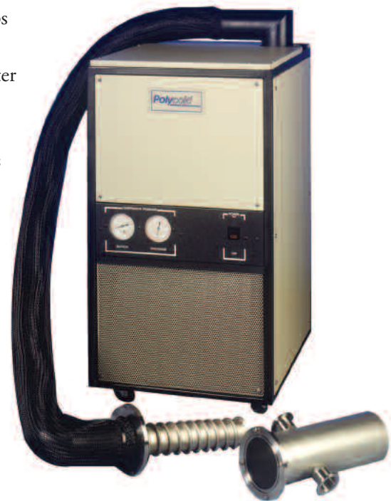
The P-100 with Cold Probe