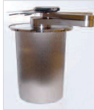
AxM 100 Series

Our GUTS rapid response system delivers unsurpassed responsiveness worldwide to any Brooks product problem. Every call to our GUTS line is answered by capable, empowered Brooks employees with the knowledge and resources to diagnose customer problems quickly and accurately. With GUTS, you are guaranteed an action plan within 59 minutes or less.