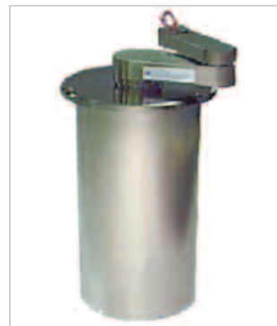
AxM 400 Series