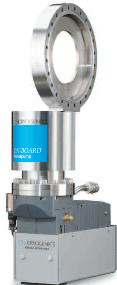
LowProfile Waterpump with 10" O.D. metal seal flange.